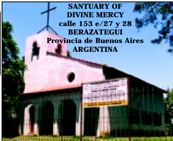
SANTUARY OF DIVINE MERCY calle 153 e/27 y 28 BERAZATEGUI Provincia de Buenos Aires ARGENTINA